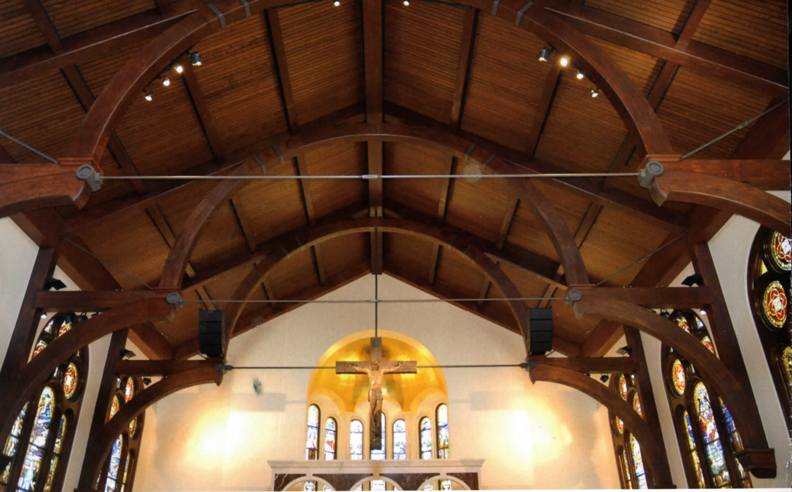
The open beam arched ceilings convey a wide selection of rich woods.

Other supporters hope the complex will become a religious and architectural landmark for the school and neighborhood.