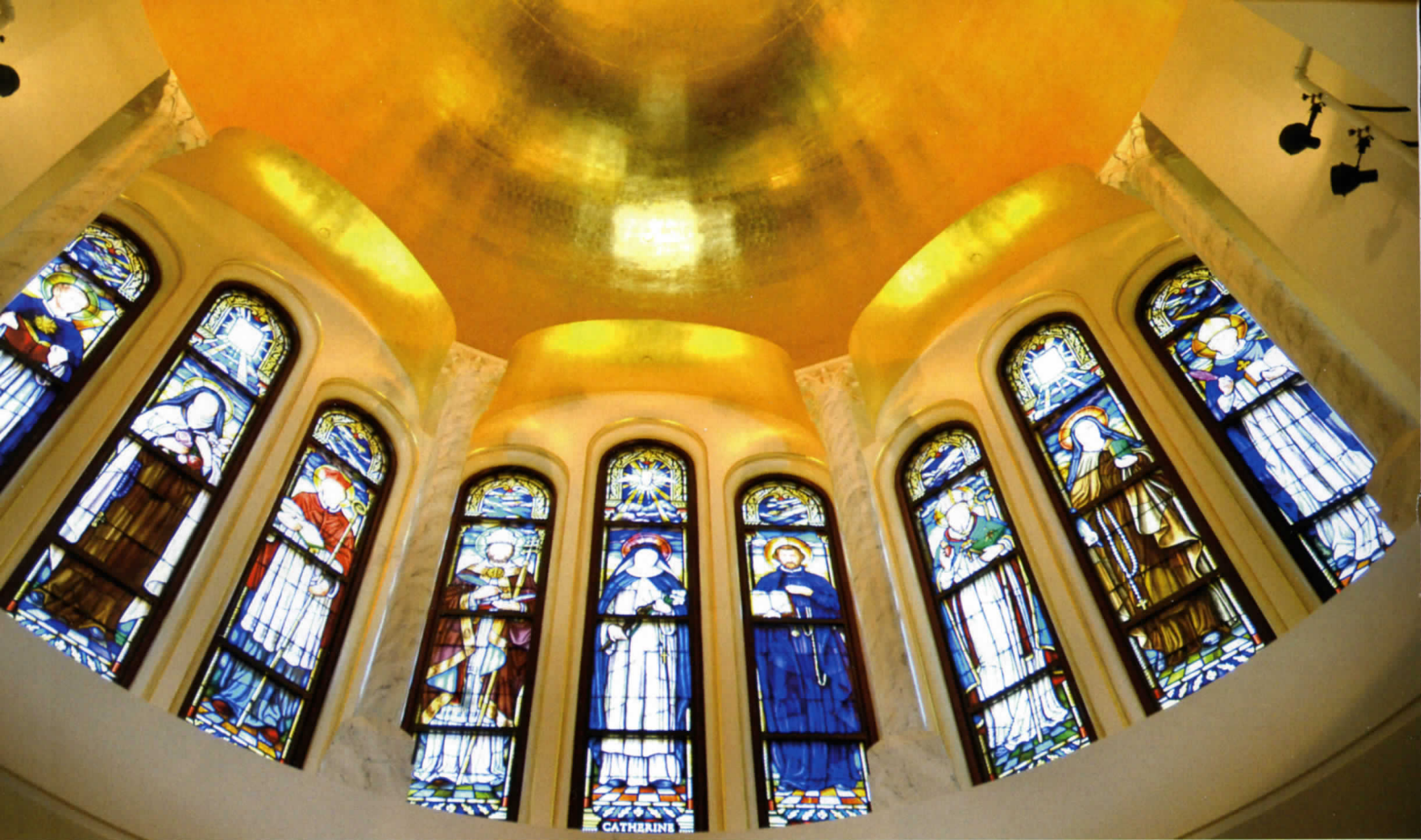
Above the tabernacle is the gold-leaf dome with nine of the 33 doctors of the church in stained glass by Judson Studios of Los Angeles.